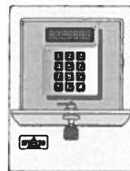
Protection for electronic locks and security system keypads