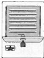
Protection for ventilation openings (i.e. pressure compensation)