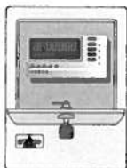
As a tamper-proof cover for electronic input devices